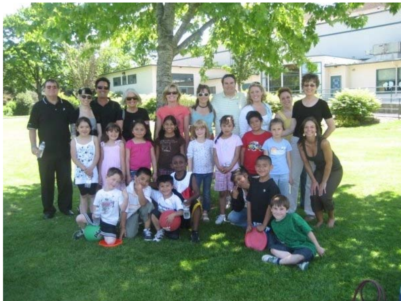
MBT Marketing and Tire Factory Adopters pose with their Adopted first-grade class at John James Elementary School in Portland.